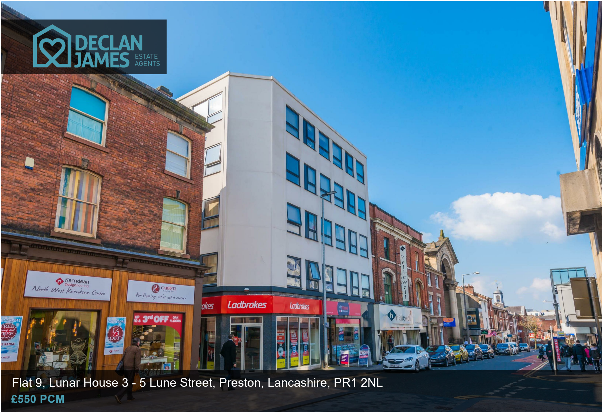
Flat 9, Lunar House 3 - 5 Lune Street, Preston, Lancashire, PR1 2NL £550 PCM